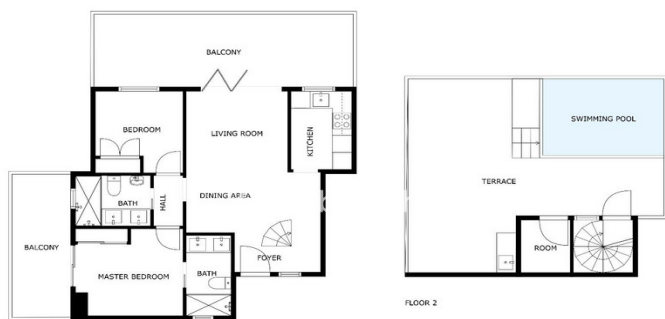
FLOOR 1 FLOOR 2 SIZES ARE APPROXIMATE, ACTUAL MAY VARY.